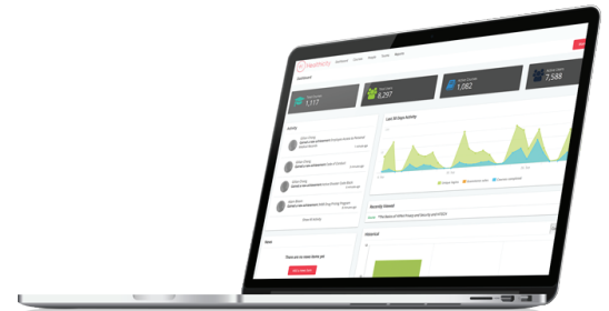
Quickly manage and report on every employee in the new Training Center dashboard.

Review performance and gain insight into training impact with reports and dashboards, or create custom reports delivered via email.